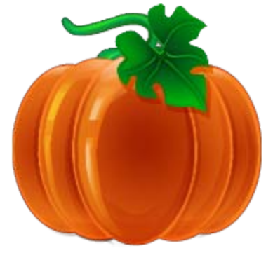
"Trick or treat!"

My BDL lump sum retro check arrived Friday: Less than I wanted, but it did come.